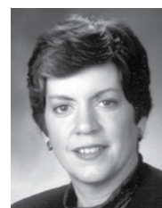
Janet Napolitano Governor