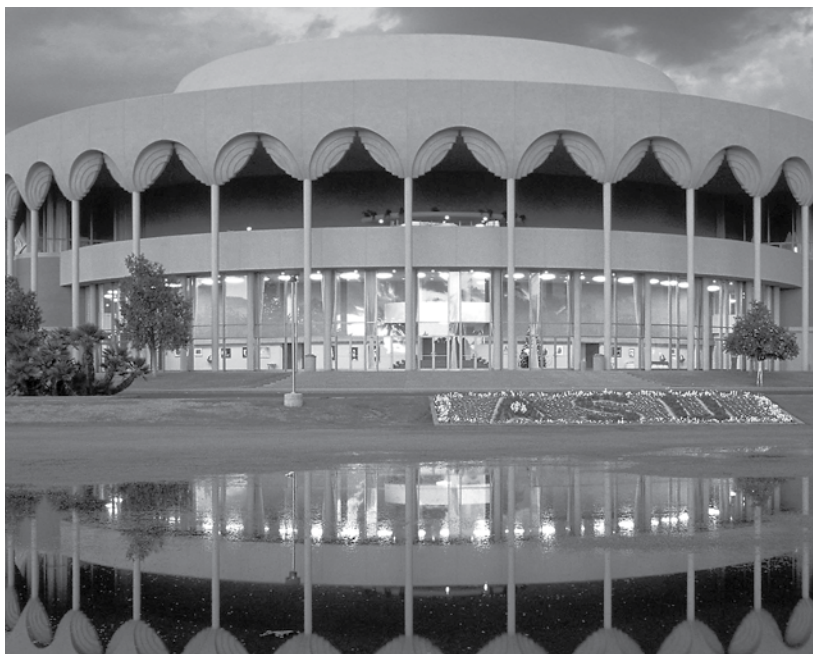
Designed by Frank Lloyd Wright, Grady Gammage Auditorium is home to Broadway shows and other productions. Phantom of the Opera, Les Miserables and Rent are just a few of the Broadway shows to come to Gammage Auditorium.

College of Public Programs – The School of Public Affairs' top 25 programs nationally include the masters program in Public Management and Administration and the masters program in Public Policy Analysis.