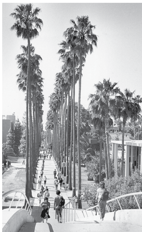
Palm Walk is one of the most picturesque spots on the Arizona State campus.

ASU is an active partner with the private sector in initiatives to enhance the social well-being, economic competitiveness, cultural depth, and quality of life of metropolitan Phoenix and the state.